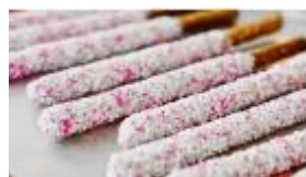
VALENTINE WHITE DIPPED PRETZEL RODS

EACH CRAFT LISTED ABOVE HAS INSTRUCTIONS ON HOW TO MAKE THEM ON THE WonderBaby.com WEBSITE