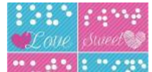
BRAILLE VALENTINE'S PRINTABLES