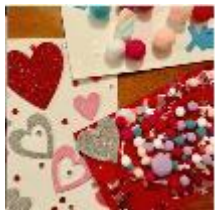
FELT HEART CRAFT SET