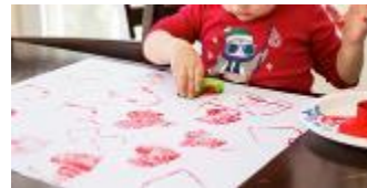
VALENTINE SPONGE PAINTING

To me it's about crafts, textures, tastes and smells. What a great opportunity to introduce your child to new crafts, maybe textured play dough and of course cookies and chocolates! Making Valentine's cards for those we love is a fun way to let our friends and families know that we care, and it's so easy to help your child get involved, enjoy new experiences and even add braille whenever possible! READ MORE at: WonderBaby.org