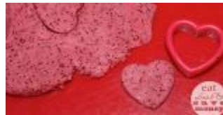
VALENTINE'S PLAY DOUGH