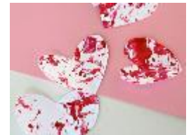
SHAKE IT UP HEARTS